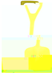
Non Sparking Shovel