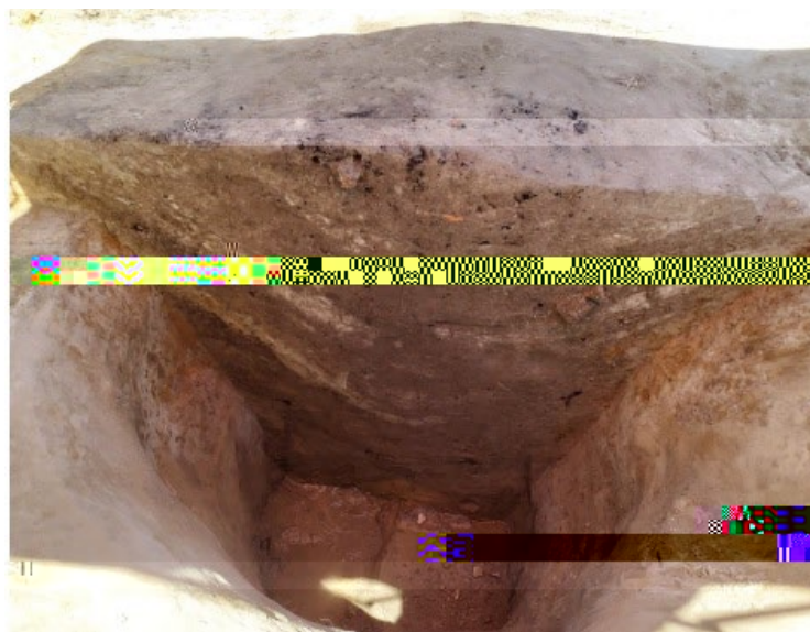
South profile of Feature 372 at 1MB513 showing the extent of the feature from the ground surface down to the water table

Feature 372 was a newly discovered barrel well at site 1MB513. It presented initially as a dark oval stain about 165cm by about 145cm, revealed during mechanical stripping. The central portion of the stain showed evidence of burning, including large pieces of charcoal. Colonial-era artifacts such as faience sherds were obvious on the surface. Upon excavation, the feature was revealed to be a column of many slumped-in moderately well-defined layers of feature fill. At the water table, about 94cm below the stripped surface, the bottom edge of the rotten barrel became evident as curving stains in the sand on the lower, outer edge of the feature fill. Below that, surviving fibers from the rotten barrel staves could be observed. Colonial-era artifacts continued sparsely to the water table. At that point, hand-excavation became too difficult, and mechanical excavation was employed – the remains of a partially-rotted barrel were pulled up in pieces.